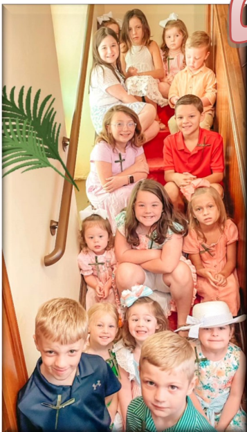
Children wave palms for Palm Sunday

We had a wonderful turnout for the Easter egg hunt on Palm Sunday! Thank you all who donated eggs/candy & helped out! We have some fun things planned for the upcoming summer and are excited to spend time together in fellowship. Please keep a check on the Facebook page for details about our Wonderful Wednesday trips for our school aged kids as well as details for our upcoming VBS (July 10-13). We will also be doing a children's musical this summer! Details will be coming soon!