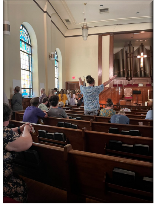
Community churches come together to pray

Thank you for the youth that volunteered to serve at our Maunday Thursday service. This summer we plan to do some local mission work as well as a few fun trips together. Follow our Facebook page or the bulletin for more information.