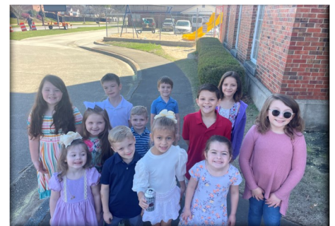
Playground after children's church