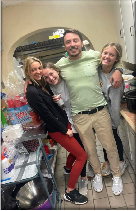
Youth help with Holy Week services

Thank you for the youth that volunteered to serve at our Maunday Thursday service. This summer we plan to do some local mission work as well as a few fun trips together. Follow our Facebook page or the bulletin for more information.